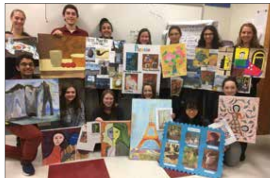
Students from the French classes celebrated National French Week with themes including Cuisine, Science, Technology, and Careers, The Arts and Arts and Crafts, Community Events, Sports, Games, Traditions, and Music and Dance. Students of French at all levels designed posters depicting food, fashion, sports, art, architecture, and more.