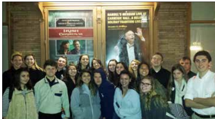
Madrigals outside Carnegie Hall about to perform on the legendary stage. The Madrigals were invited to be part of a 200-voice choir for The American Christmas Carol , a benefit performance.