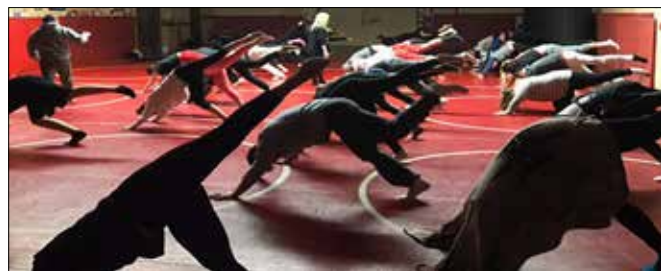
A yoga class was well received by students in BHS' Anatomy class. Instructors used anatomical terminology to describe yoga positions and muscle groups. Students were excited to boast of their understanding of sophisticated anatomical vocabulary.